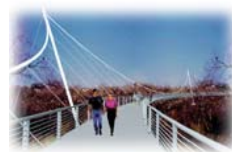
Falls Park on the Reedy River